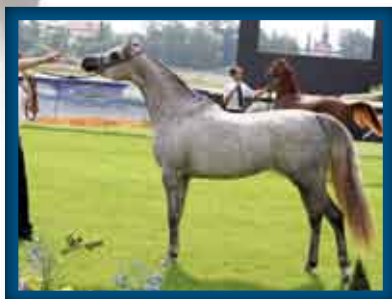
OM EL ENIGMA 2° Pl. Fillies 2 yr old