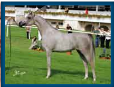
JUWANDA OS 2° Pl. Fillies 1 yr old (Junior)