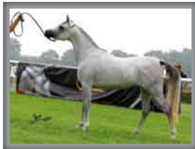
SALOMEH 2° Pl. Fillies 1-3 yrs old (B)