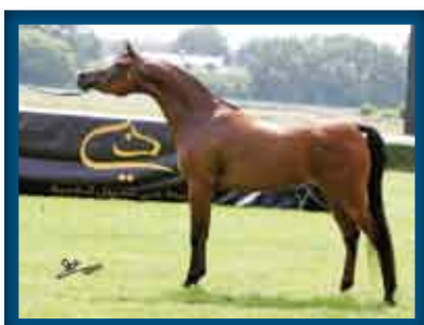
KHARREA PGA 1° Pl. Fillies 3 yr old