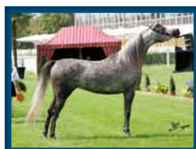
SHOWNEL 2° Pl. Fillies 3 yr old