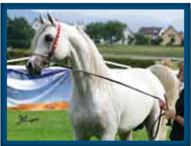
KASEEM 2° Pl. Stallions 4-6 yrs old