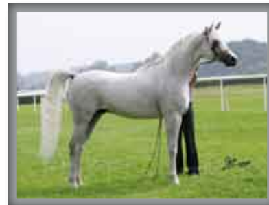
NEDSHD MANSOUR 1° Pl. Colts 1-3 yrs old