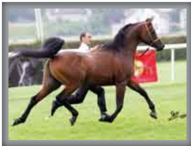
PYRAMID AALIN 2° Pl. Stallions 4 yrs and over (B)