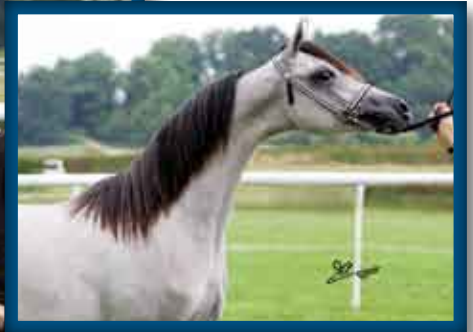
(Marwan Al Shaqab*/HB Bessolea) Breeder: Taylor Arabians/USA Owner: Al Khalediah Stables/KSA