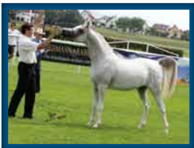
AJA SANSTORM 2° Pl. Colts 2 yr old