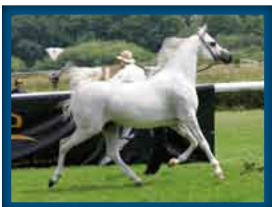
PREMIUM 1° Pl. Colts 2 yr old