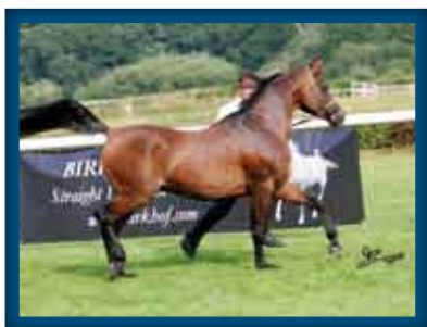
PYRAMID AALIN 2° Pl. Stallions 7-9 yrs old