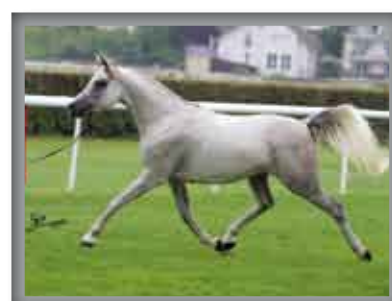
AL NAJMA OLIVIA 1° Pl. Mares 4 yrs old and over