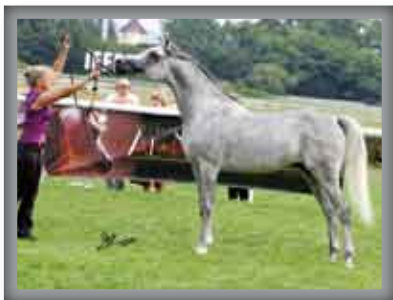
HAMRA ALIMAAR 2° Pl. Stallions 4 yrs and over (A)