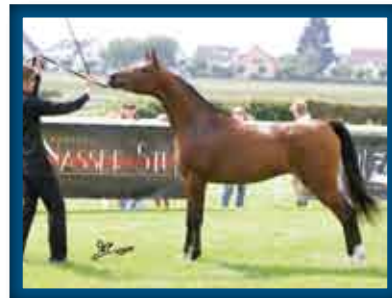
MISS MARENGA 1° Pl. Fillies 2 yr old