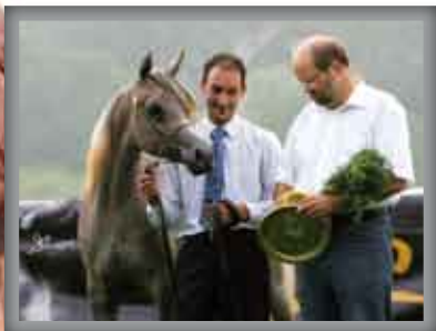
PYRAMID SADIYYA 2° Pl. Fillies 1-3 yrs old (A)