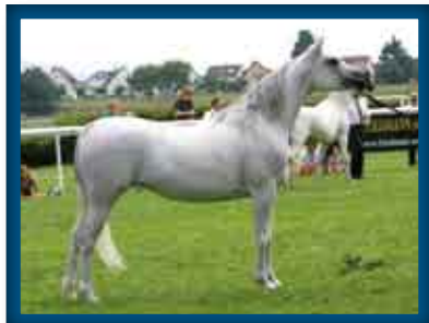
PYRAMID LANEYA 2° Pl. Mares 4-6 yrs old