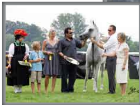
Imperial Madori x Nil Allure Breeder: Rahim Stud EGY Owner: Sharbatly Arabians EGY