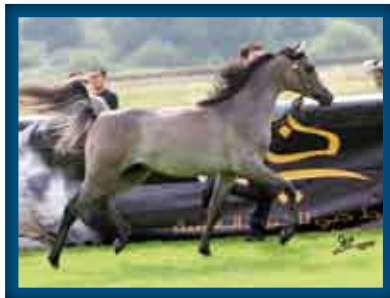
PYRAMID KAHILEH K 2° Pl. Fillies 1 yr old (Senior)