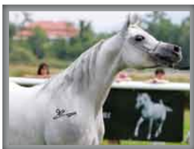
PYRAMID LANEYA 1° Pl. Mares 4 yrs old and over