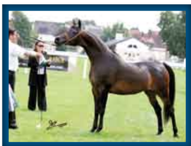
PRIETA 1° Pl. Mares 10 yrs & over