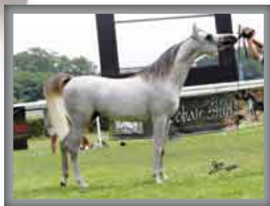
TF SHAMAAL 2° Pl. Colts 1-3 yrs old