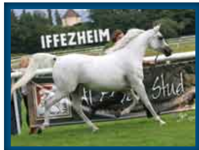
HAMRAS MUSINA 2° Pl. Mares 7-9 yrs old