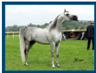
OM EL BAHREYN 1° Pl. Stallions 7-9 yrs old